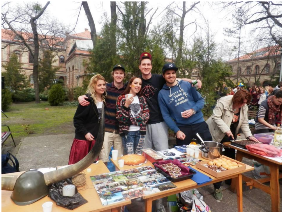
(ABOVE: A HANDFUL OF THE TEAM AT INTERNETIONAL DAY '15)