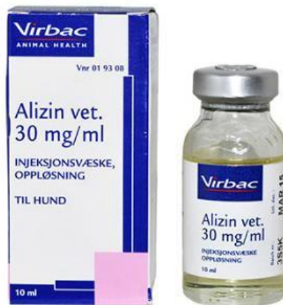
Figure 3: Aglepristone under the brand name Alizin vet (Virbac, no date, accessed 20 th of October 2017)