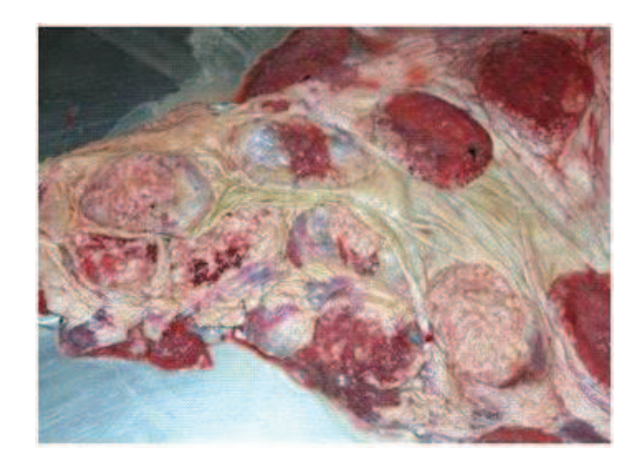
Figure 9: Mycotic Placentitis (Dr Mark Swendorwski, 2008)

and on the foetal skin there might be small circular lesions which can resemble ringworm lesions.(Department of Agriculture, Food and the Marine & Agri-Food Biosciences Institute, 2012). They usually occur sporadically in the last two months of the gestation (Djonne, 2007). In Ireland in 2012, 28 of the foetal submissions were proven Aspergillus positive in 2013. There were also 20 additional abortions caused by other fungal/yeast species in 2013 (Department of Agriculture, Food and the Marine & Agri-Food Biosciences Institute, 2013). It is identified in the lab by showing that there are fungal hyphae in the contents of the stomach of the foetus, on the skin or in the placenta. Preventative measures to be taken include proper preservation of grains, hay and silage to prevent conditions ideal to fungal growth.