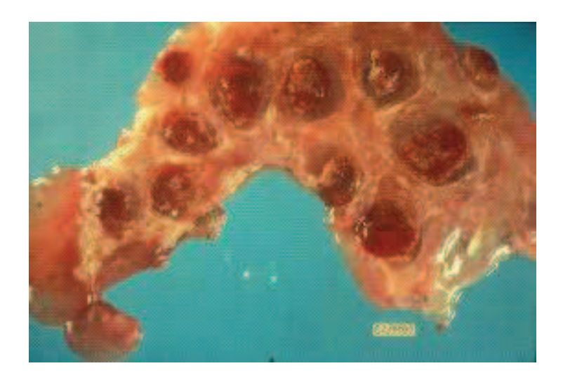
Figure 12: Bovine placenta showing numerous haemorrhagic cotyledons, as a result of infection by Brucella species (Vetnext, 2014).

gradually reduced the testing requirements. Herd owners are advised when they need to test their herd. An annual test is required on any female animal aged 24 months or more, and bulls aged 24 months or more. In the north these tests are done on any animal aged 12 months or older which is intended for breeding purposes. Any susceptible animal moving into a new farm must have had a negative brucellosis test within 60 days of entering the new herd, and any animal moving across the border must have had a negative brucellosis test in the last 60 days.