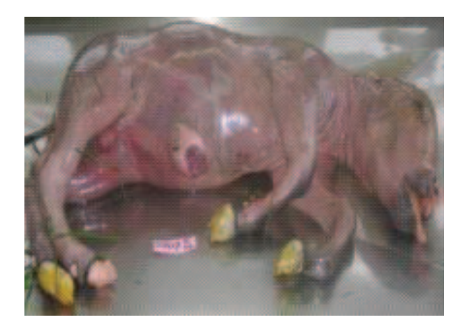
Figure 5: A foetus submitted for post-mortem which tested positive for Salmonella dublin (Department of Agriculture, Fisheries and Food & Agri-Food Biosciences Institute, 2010)

around the seventh and eighth month and the placenta will often be retained. The foetus can be mummified and have a distinct odour, or may be emphysematous. There may be pale indistinct foci in the liver of the foetus. 5.8% of abortion submissions in Ireland in 2013 tested positive for Salmonella dublin, an increase of 1.8% from the year before (In 2012, 4.0% of foetal submissions tested positive for Salmonella dublin). In 2013 there was a peak in October and November. This could be due to factors causing stress, for example housing and drying off in carrier animals (Department of Agriculture, Food and the Marine & Agrifood and Biosciences institute, 2013). Vaccination is an option, but once Salmonella Dublin has entered into the herd, vaccination alone will not stop the spread of infection and good animal husbandry and hygiene is of major importance if control is to be achieved.