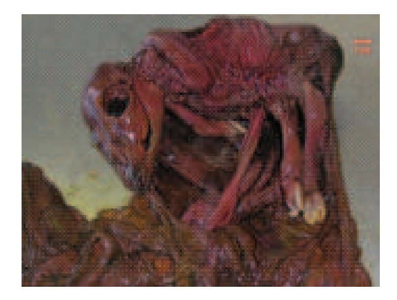
Figure 2: An example of a mummified foetus. (Department of Agriculture, Fisheries and Food and Agri-Food Biosciences Institute, 2010)

The gravid uterus has a higher sensitivity to pathogens when compared to the inactive or immature uterus. Infection can reach the uterus or foetus in many ways: via the lymph system, hematogenously, transplacentally or can ascend from the vagina through the cervix. Ruminants have a cotyledonary type placenta. This means there is a large area to accommodate the accumulation of infectious agents and exudate which can help lead to the higher risk of abortions (McGavin & Zachary, 2007). There are many different pathophysiological processes which can occur and lead to foetal death, and so lead on to resorption, maceration, mummification, emphysema and autolysis of the foetus (Maxie, 2007).