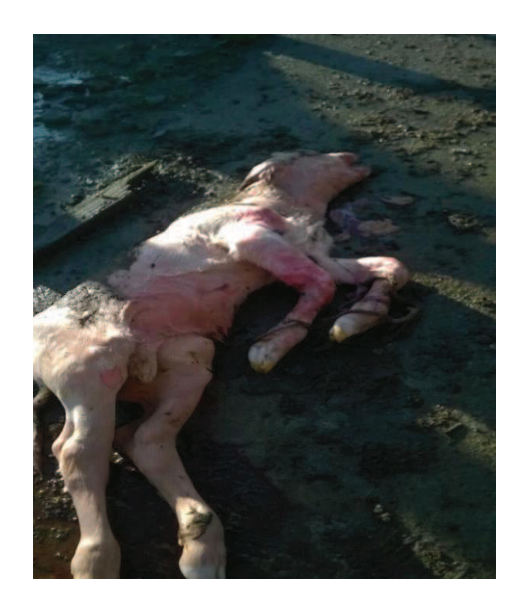
Figure 1: A still born Calf. (Kenny, 2014)

The term abortion means the premature expulsion of the foetus from the dam. It occurs because the foetus has died. It is called an early embryonic death when the mortality occurs up to the 42^{nd} day of the pregnancy (McGavin et al , 2001). If it occurs before the second month, the foetus will usually be resorbed by the dam, and the cow will present as one not in calf, usually with no other clinical signs. If it occurs when the foetus is older than two months, the foetus and placental tissues will be shed by the cow. If it occurs near term and the calf is born fully formed but dead, this is called a stillbirth (Bagley, 1999).