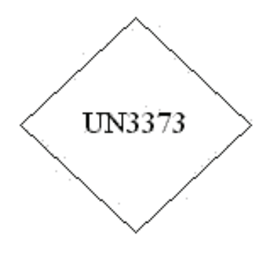
Figure 4: The hazard symbol which should be displayed on the outer packaging of samples (Department of Agriculture Food and Marine, 2014).