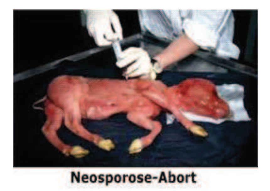
Figure 6: Foetus aborted due to neospora infection (Institut für parasitologie, 2000).