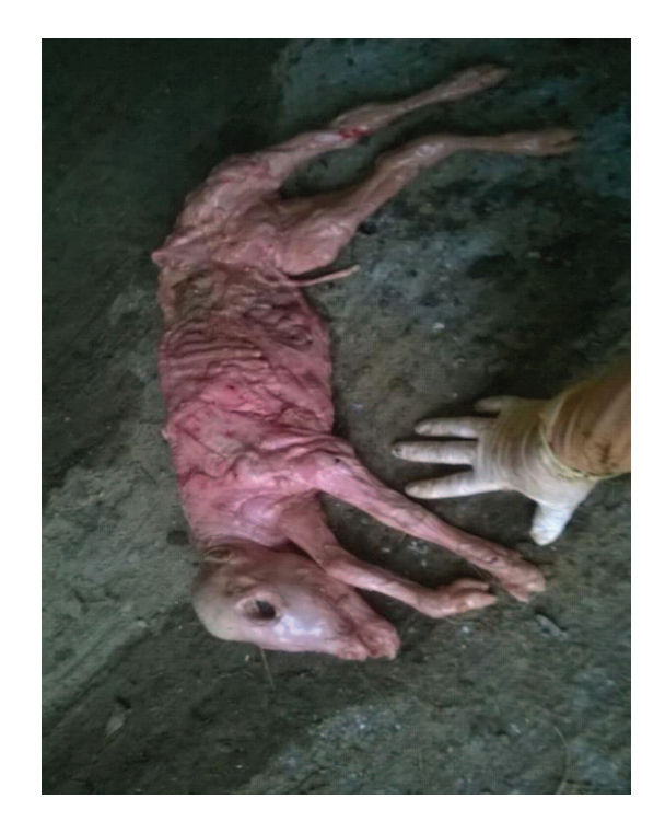
Figure 3: An example of an autolysed foetus.