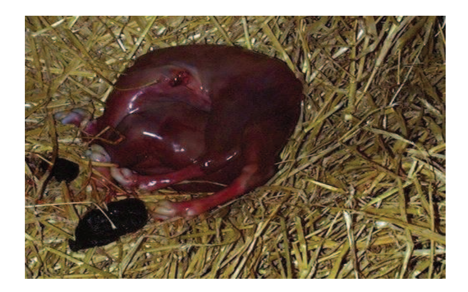
Figure 10: Bovine Viral Diarrhea virus may cause Foetal death or abortion (National Animal Disease Information Service, 2014)