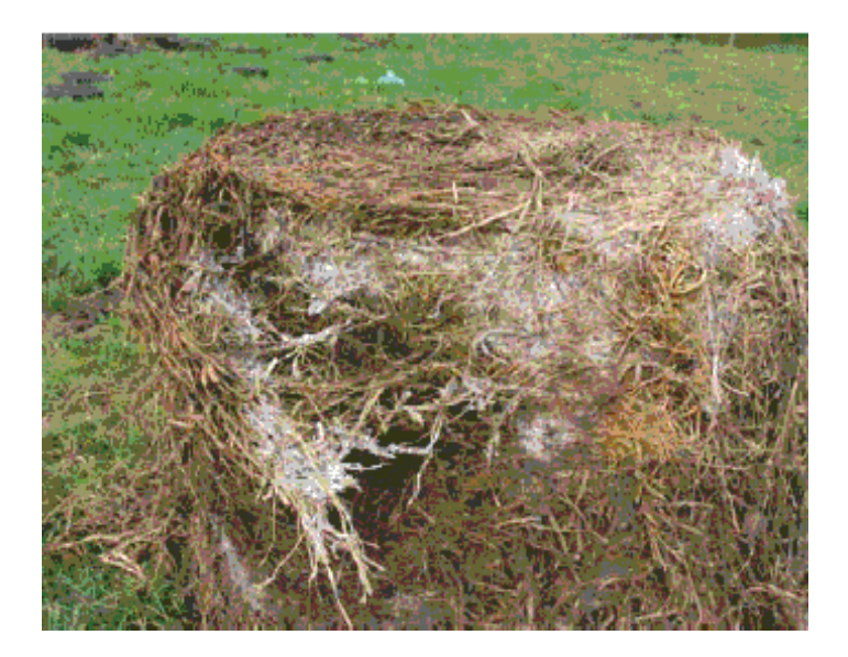
Figure 7: an example of incorrectly preserved silage which could pose a serious risk to bovine health. (The Dairy Site, 2012)