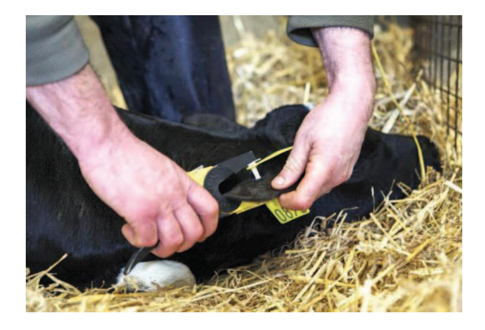
Figure 11: An example of the ear tags supplied by the Department of Agriculture to take an ear tissue sample while ear tagging as part of the National BVD Eradication program (Irish Farmers Journal, 2014)