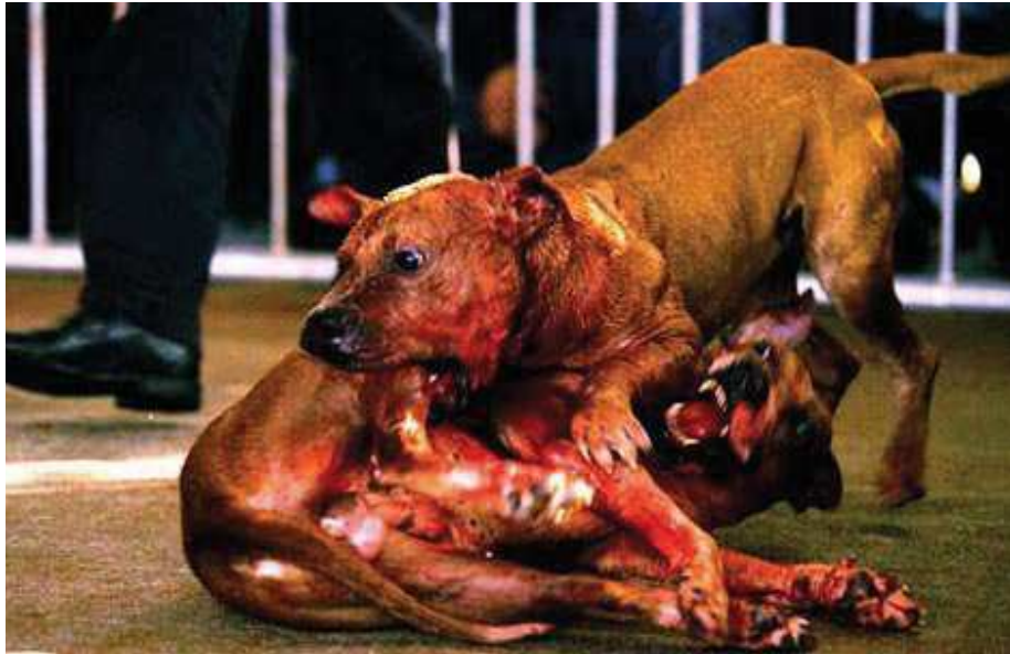
Figure 4. Shows a picture of an illegal dogfight 5 .

Dogs that take part in dogfights may get many and serious injuries, such as severe bruising, deep puncture wounds and broken bones. If they are hurt badly they often die within hours or days of the fight, due to blood loss, dehydration, exhaustion, shock or infection. The dogs used for fighting is breed for this purpose, where the parent animals are selected based on traits desirable for fighting, such as good muscling and display of aggression. In addition, these dogs are trained in special ways for preparing the animals for the fight. One training technique uses pray animals, upon which the dog learns how to kill. If a dog cannot be used in the fighting pit, they are frequently subjected to abuse or euthanized in a painful manner. In fact, 25 per cent of all dogs abused in the United States are pit bulls 6 .