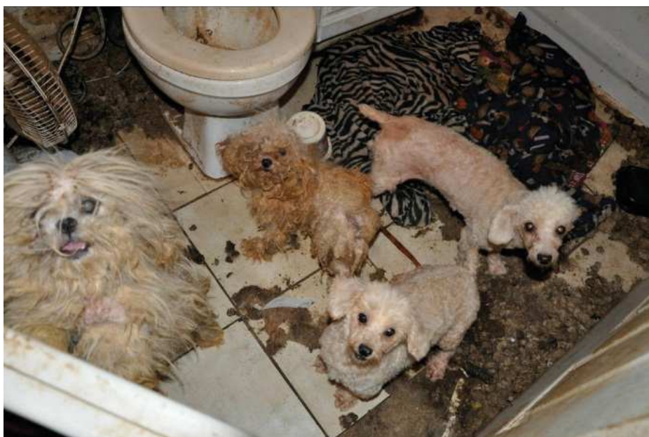
Figure 5. Picture from an animal hoarding case where forty dogs were rescued 7 .

The psychological background of animal hoarders is not completely understood. As of now, this condition has not been connected to a specific psychological disorder. However, some common features and theories about the condition are proposed. These psychological features may include a strong affection for animals, often being characteristics for their identity, for example the ‘cat lady’. They also have a strong need of being in control of these animals and the thought of losing them will cause great suffering. The Hoarding of Animal Research Consortium (HARC) has found suggestive evidence of a link to growing up in chaotic homes, with an unstable upbringing. In such environments, the animal can often be the only stable feature present through the childhood and adolescents.