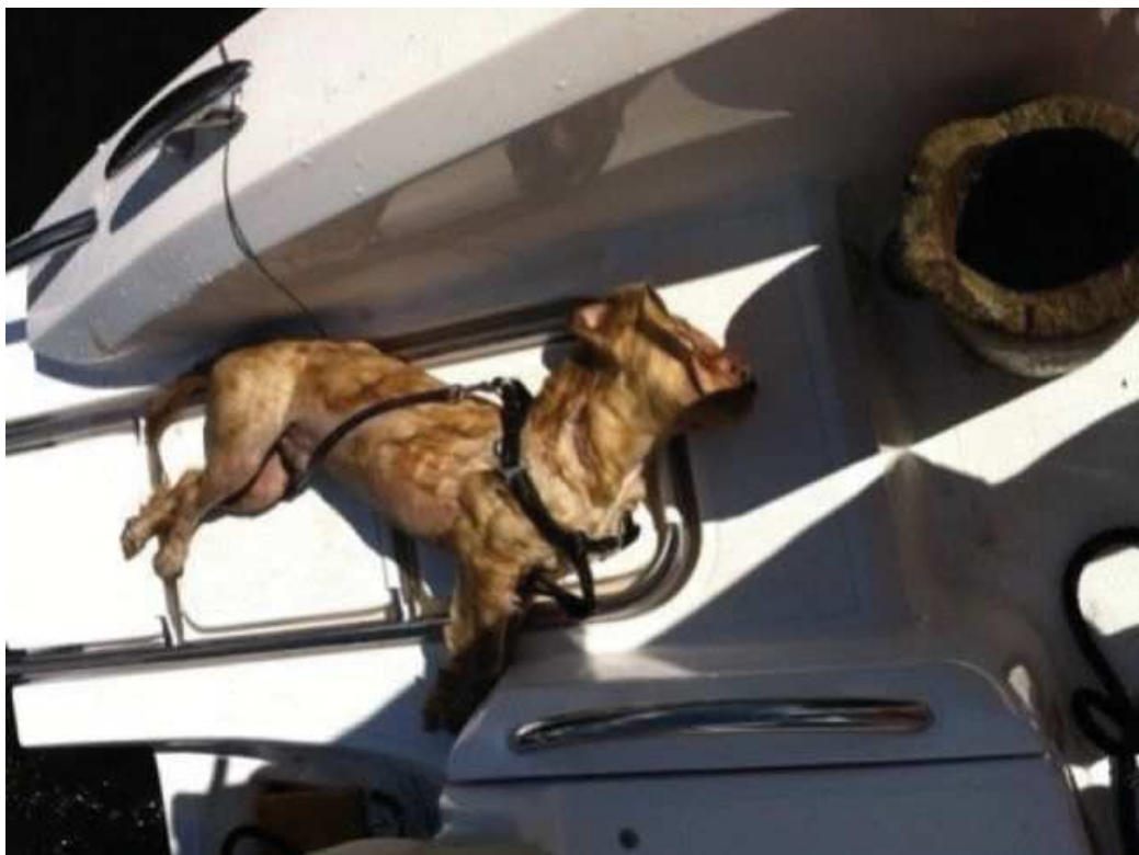
Figure 7. Picture of the dog Lukas that was thrown into a river to drown. The dog was noticed by some random people passing by, but it was too late 13 .

dog that was tied to an iron pipe and dropped six meters into a river to drown 12 . Someone found the dog shortly after and reported it to the police. The owner turned himself in and stated that the dog had major behavioural problems, because the dog had been mistreated by its previous owner and it was going to be euthanized. Many people working for animal rights were hoping for the maximum sentence of three years in prison, as the dog was put into a situation with great suffering and pain. This did not happen, the owner was sentenced to six months in prison and lost the right to have any pets the next ten years. Even though the sentence was higher than what have been seen in previous cases, this was still a set back in the fight for animal rights.